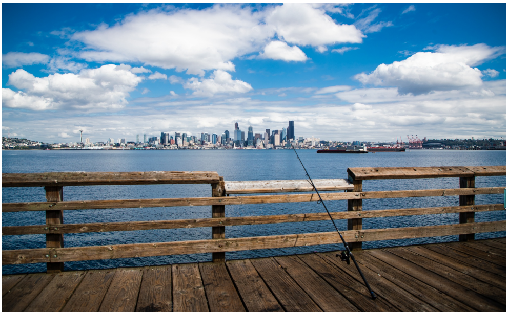
47.5667° N 122.3868° W