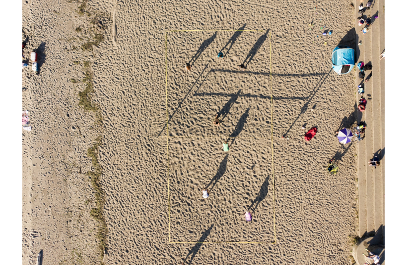
BEACHES BONFIRES ACTIVE LAID BACK FAMILY FRIENDLY